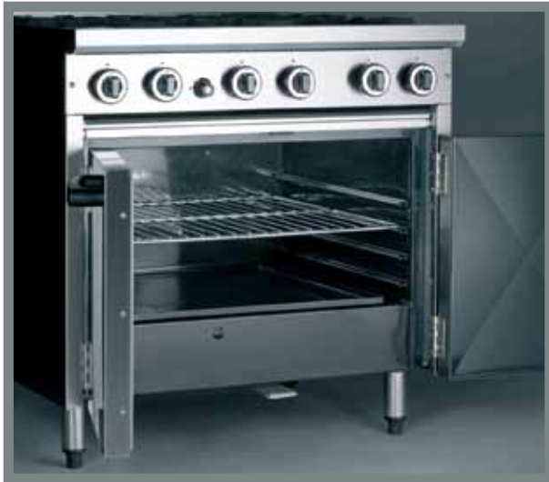
The 900mm wide Cobra Oven Range features a full width oven with generous crown height.